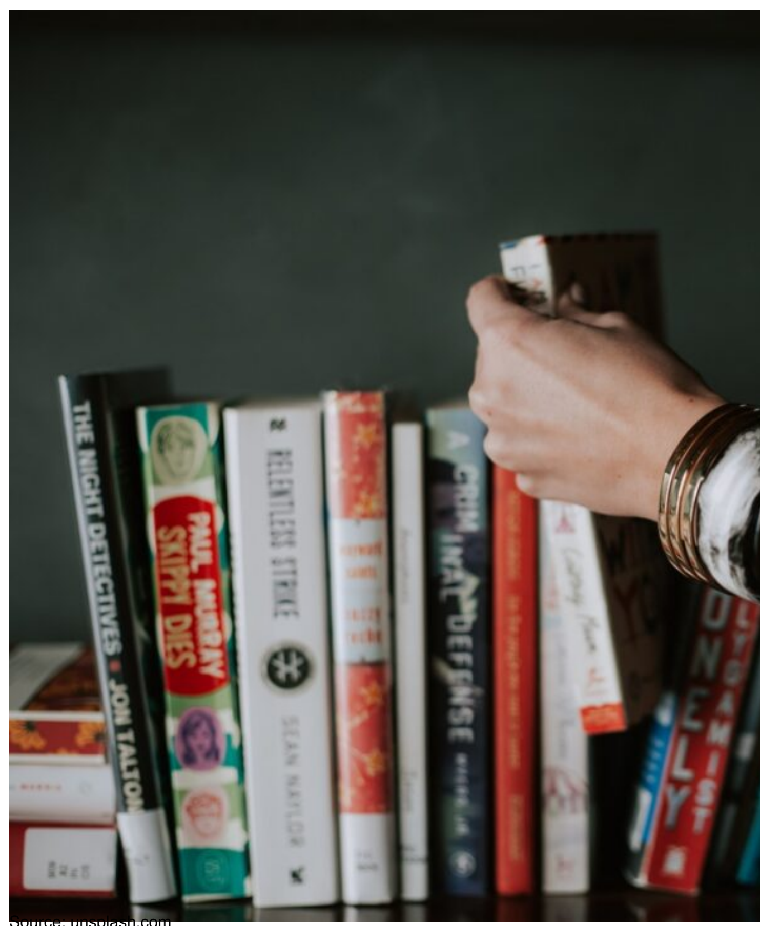
8. Casino. Love and Honor in Las Vegas – Nicholas Pileggi